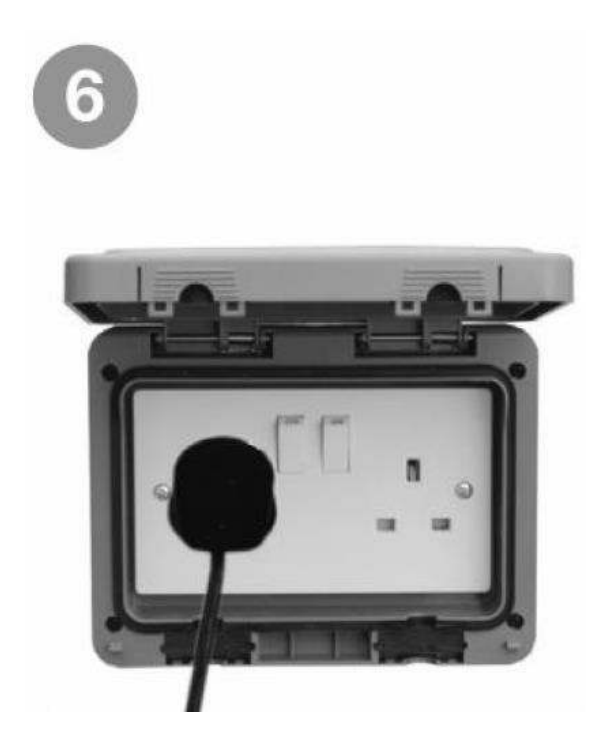
Connect the plug from the transformer to your mains outlet