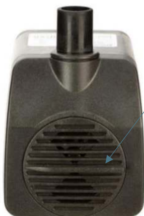
Water flow adjuster

The flow of the water can be adjusted by turning the dial on the water pump.